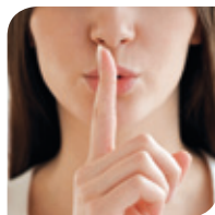
Very low sound level

With its titanium condensers, PowerFirst Premium can heat any pool water whatever its origin and treatment process (seawater, chlorine treatment, bromine, ozone, chlorine free, electro-physical, electrochemical).