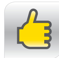
RELIABLE: Titanium condensers

Zodiac® proposes "Four seasons" models which can generate heat even in extremely low temperatures (up to -8^{\circ}\text{C} ). Ideal to extend the period of use of your pool (indoor or sheltered pools).