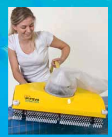
Easy to handle, weighs just 15 kg.